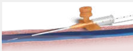
Entering the vein