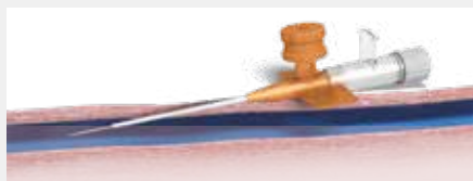
Placing the 14GA catheter

Adapt flexibly to the particular vein in terms of energy, power and approach.